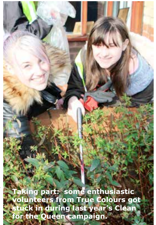
Taking part: some enthusiastic volunteers from True Colours got stuck in during last year's Clean for the Queen campaign.

We're open to all ideas, from litter picks and greening campaigns... to art projects and heritage trails. Let's be really ambitious: what do YOU think we can ALL do to make a difference to Railway Road? In the meantime, we're holding a litter pick on Friday 7th April, 10am - 4pm along the length of Railway Road... and we'd love it if you would join us! In the meantime, you can keep up to date with how we're getting along in future issues of our newsletter, by visiting our website, or by following us on Facebook and Twitter.