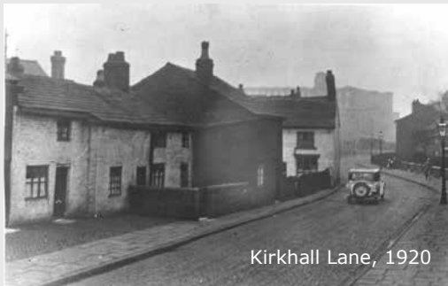
Kirkhall Lane, 1920

"Ultimately, we aim to install a series of information panels across the area sponsored by Leigh Neighbours which will evoke memories of the past, stir people's curiosity and inspire pride in the patch.