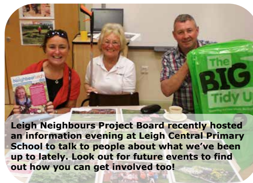
Leigh Neighbours Project Board recently hosted an information evening at Leigh Central Primary School to talk to people about what we've been up to lately. Look out for future events to find out how you can get involved too!