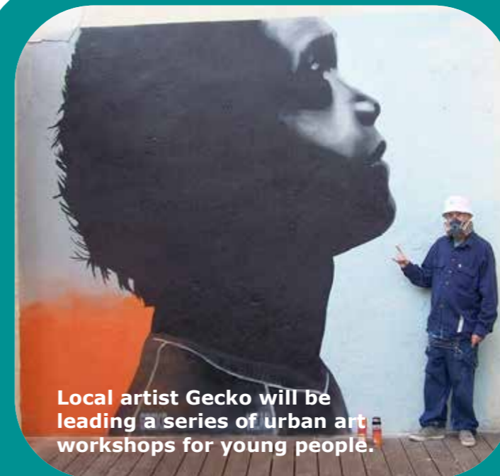
Local artist Gecko will be leading a series of urban art workshops for young people.