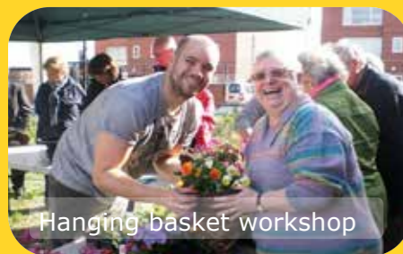
Hanging basket workshop

This newsletter is brought to you by Leigh Neighbours, a community project set up by Big Local, a National Lottery charity which is investing £1 million in your area over the next 10 years. Leigh Neighbours Project Board is working hard to deliver on the issues you told us were important to you, such as improvements in housing, training opportunities for young people, environmental projects and increased community spirit. If you would like to find out more, go to www.lnpb.org.uk